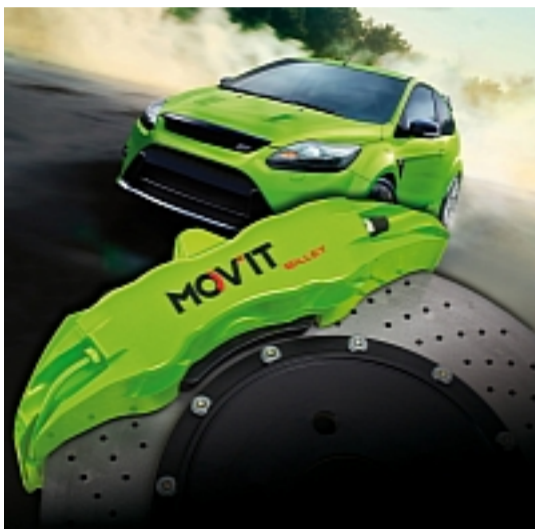
Ford Focus RS Movit brakes

Ford has announced that it will introduce the new (concept) incarnation of the Ford Focus ST at the upcoming Paris Auto Show, but the current generation big brother of ST, the Focus RS, still manages to make it into the headlines.